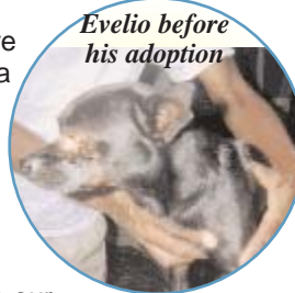
Evelio before his adoption