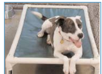
This could be a Sato!

The Kuranda Dog Bed Company has created a wonderful program to help animal shelters and rescue organizations receive sturdy, long-lasting chew-proof dog beds at a reduced rate. The details of the program and an on-line sign-up form can be found on our homepage at www.saveasato.org . Save a Sato is in desperate need of beds for its bigger dogs, who need a raised place to sleep when it rains.