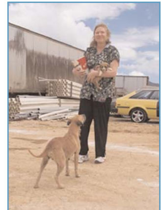
Nita's rescue at a construction site

To make a donation through our website, please visit us at: www.saveasato.org .